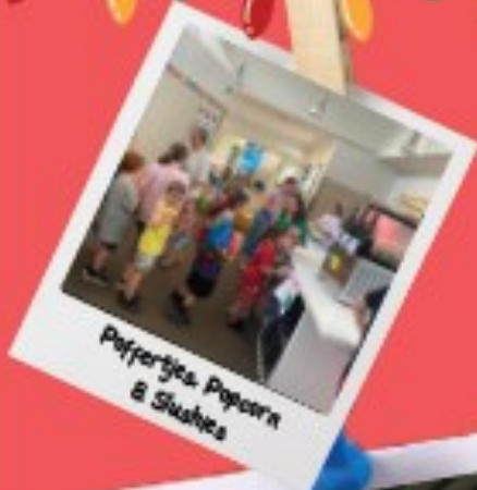
Popcorn, Popcorn & Slushes