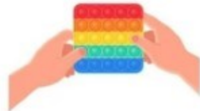
Quiet activity or break alone

he's extraordinary TOOLS FOR RAISING AN EXTRAORDINARY PERSON