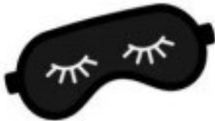
Dim the lights