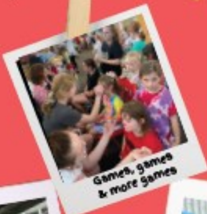
Games, games & more games