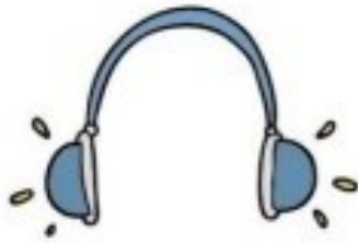
Noise reducing headphones