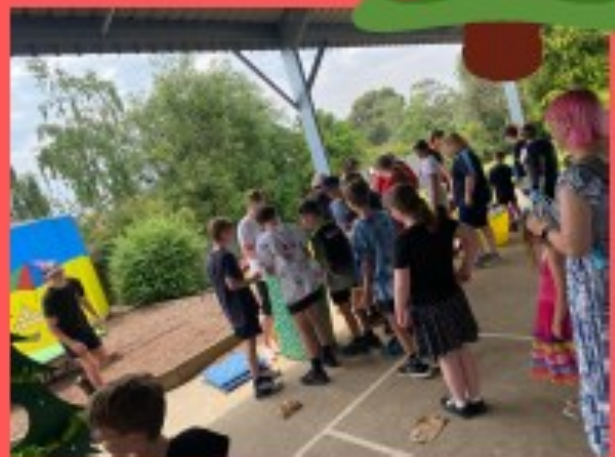
We raised over $1100 which will be used for JSC initiatives in 2024. Stay tuned!