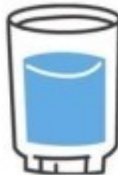
Drink of cold water