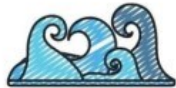
Calming nature sounds